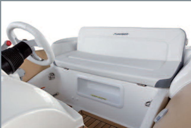
2 passengers rear seats

Many seats, incredible space / Choice of 3 tube colours / High level of