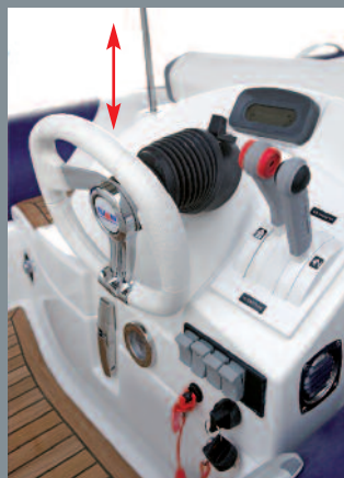
Folding steering wheel