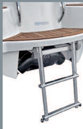
Telescopic bathing ladder